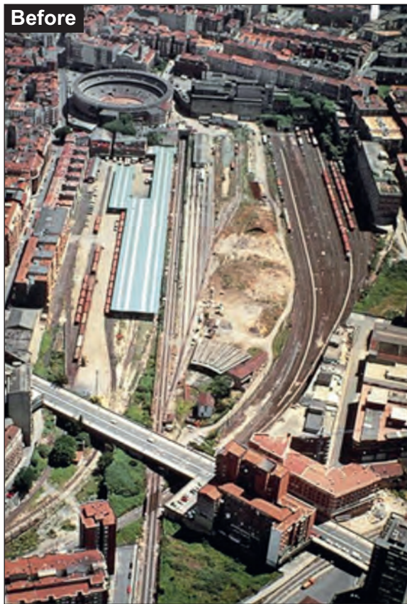
Figures 2a and 2b: An industrial area in Bilbao that has been regenerated